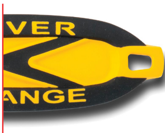
Innovative Plastic Tape Splitter