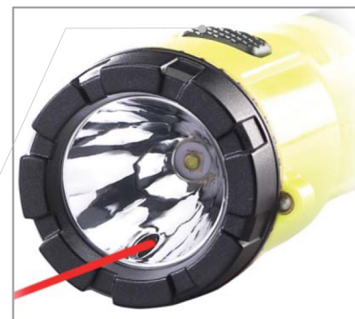
Red laser pinpoints objects at a distance

Dual, independently operating push-button switches for spot beam, laser pointer, or both modes simultaneously Easy to use with gloves