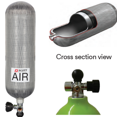
Right Angle Valve Cylinder