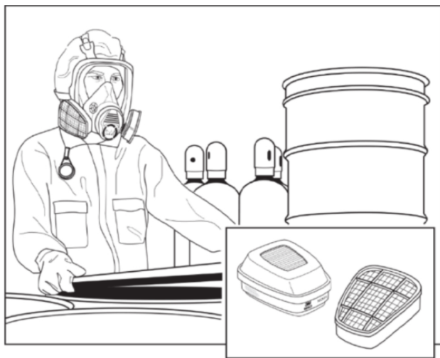
3M™ Multi Gas/Vapor Cartridges shown with 3M™ Full Facepiece 6000 Series and 3M™ Organic Vapor Monitor 3510.

Breathing mercury vapor or chlorine gas can pose a risk to your health. NIOSH, a Federal government regulatory agency, has tested and approved the 3M™ Mercury Organic Vapor or Chlorine Acid Gas Cartridge 6009S to help reduce exposure to these vapors and gases.