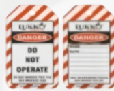
LS-T46 (1 Set) (10Pcs)